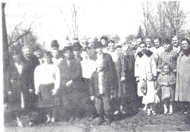
Stanley, Wisconsin--Sunday, April 6