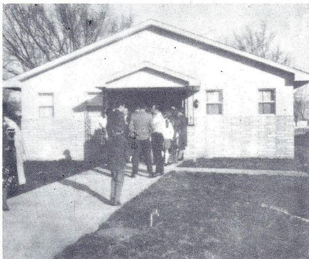
Snapshot of the new chapel at Nowata, Oklahoma Sunday, February 14, 1971.

After months of planning and much hard work the saints at Nowata, Okla. had the opening day for the new chapel on Sunday, Feb. 14, 1971. The building was well filled in both the morning and afternoon services. It was a time of rejoicing for the saints as they enjoyed the fellowship of one another and the blessings of the Spirit of God.