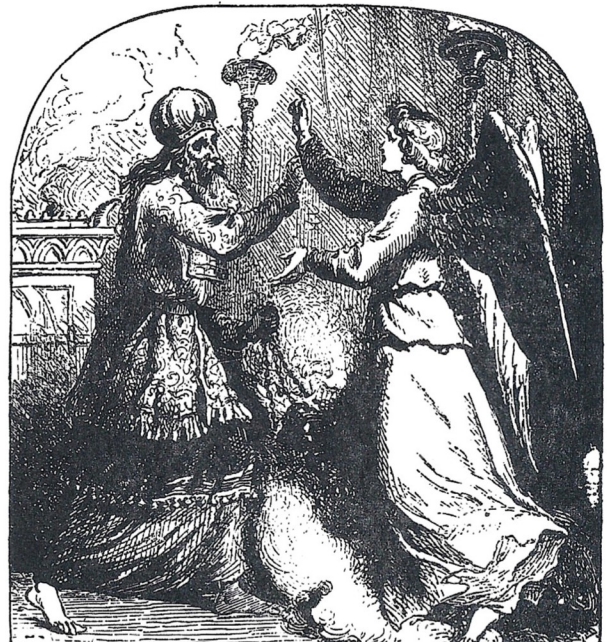
THE ANGEL GABRIEL SPEAKING TO ZACHARIAS.